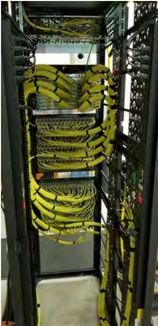
Library of Congress UHD Router